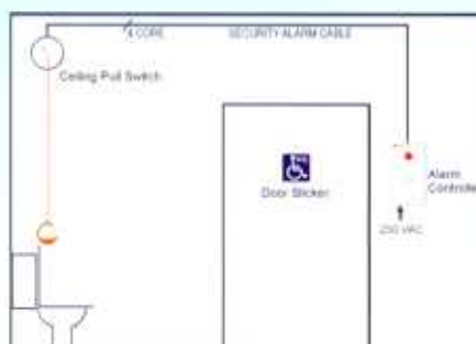
Standard Kit Configuration

Available in the "Advanced Kit", the reset point is fitted to the wall inside the toilet. It allows the call unit to be reset at the point of call, when the Alarm Controller unit is located away from the toilet, for example in the staff room or a security office. The unit is fitted with an integral re-assurance LED. This unit requires a 25mm deep single gang flush box or "round cornered" plastic surface box.