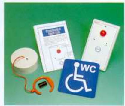
Content of Standard Kit