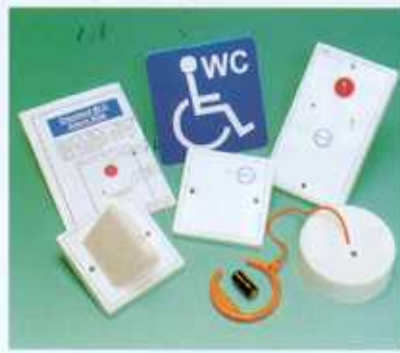
Content of Advanced Kit